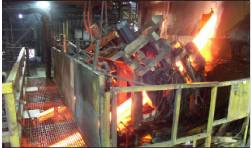
Arkansas Steel's twin caster operations, Newport, Arkansas.