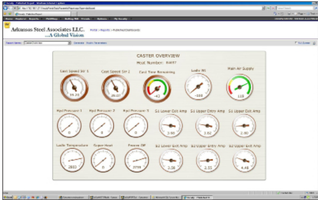
The caster dashboard provides an instant status overview.

application that will let Arkansas Steel make the most efficient use of their maintenance staff and keep production equipment running at the highest possible availability.